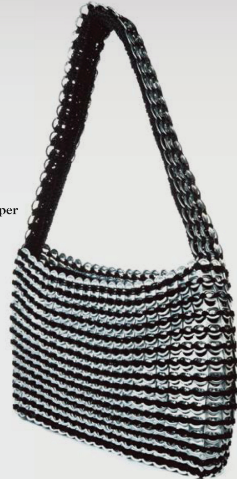
Pull-tab Beatrice Shopper by Escama Studio

Purely functional products seem made for upcycling, the added value being their transformation into something usable and beautiful.